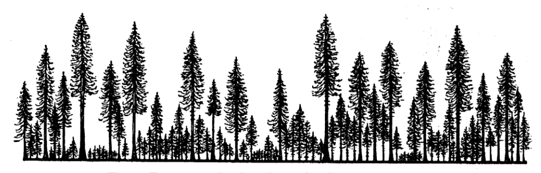
Fig.2. Forest worked under selection system

disadvantages. Due to the scattered nature of the fellings, their supervision and monitoring is difficult. The cost of logging operation and extraction is higher than any other management system. Fellings and extraction cause heavy losses to younger trees and saplings. The timber produced in selection system is of lower quality than the even-aged forest and the correct determination of the yield is quite difficult (Troup, 1966). The system is also not suitable for areas where grazing is practiced as the regeneration is spread over the whole of the forest and no area can be allocated for grazing.